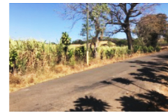
Frente de propiedad