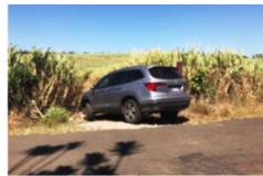
Entrada principal a la finca